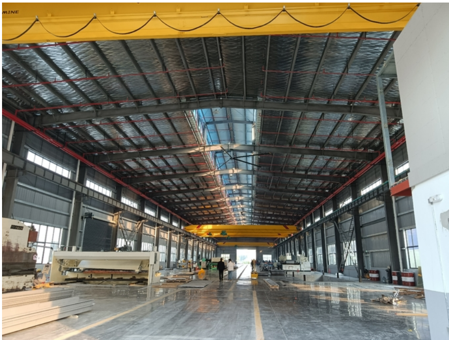
Pipe & Tube Processing